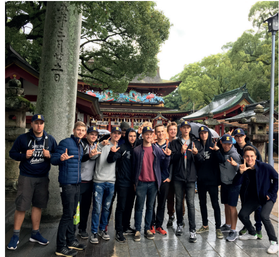
Beside baseball the team was given the chance to experience attractions such as the Dazaifu shrine