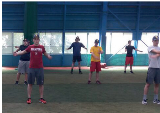
The training facilities in Japan impressed the players