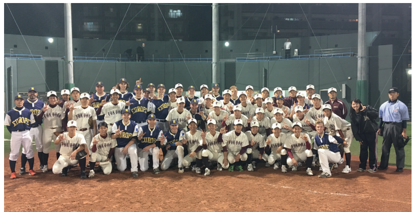
The baseball team of Fukuoka University impressed with professional behavior and high level baseball