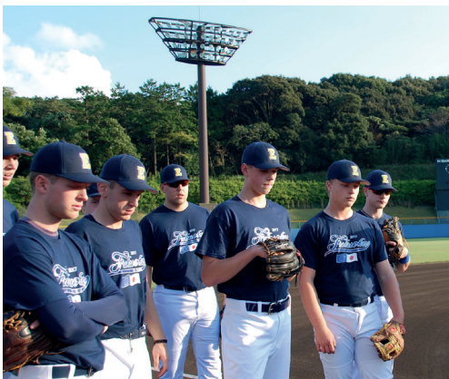
Before games TEAM EUROPE indulged in training sessions