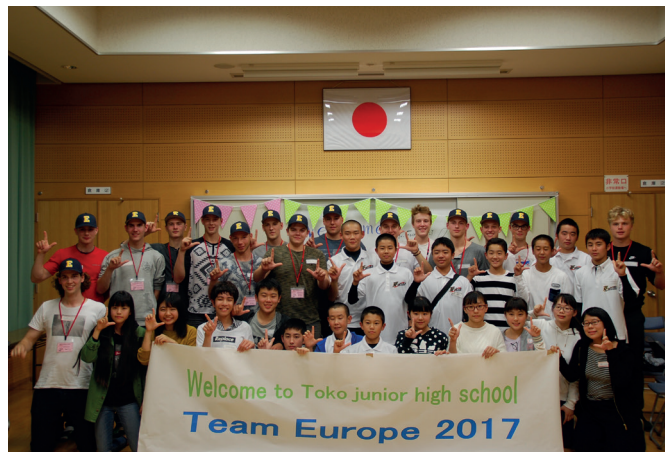
TEAM EUROPE at the reception of Toko junior highschool