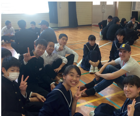
The players in exchange with the students of Toko junior highschool