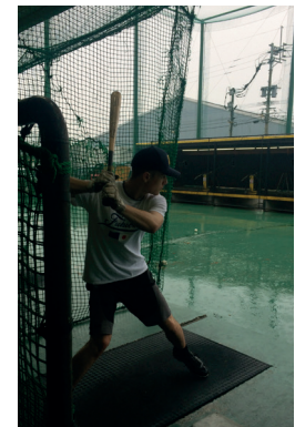
Batting practice for TEAM EUROPE

For further press inquiries + interviews + fotos please contact: