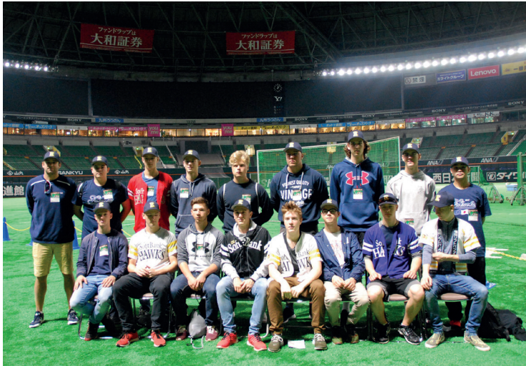
TEAM EUROPE had the opportunity to visit Fukuoka Dome, home of the Fukuoka Hawks and winner of this year's nippon series